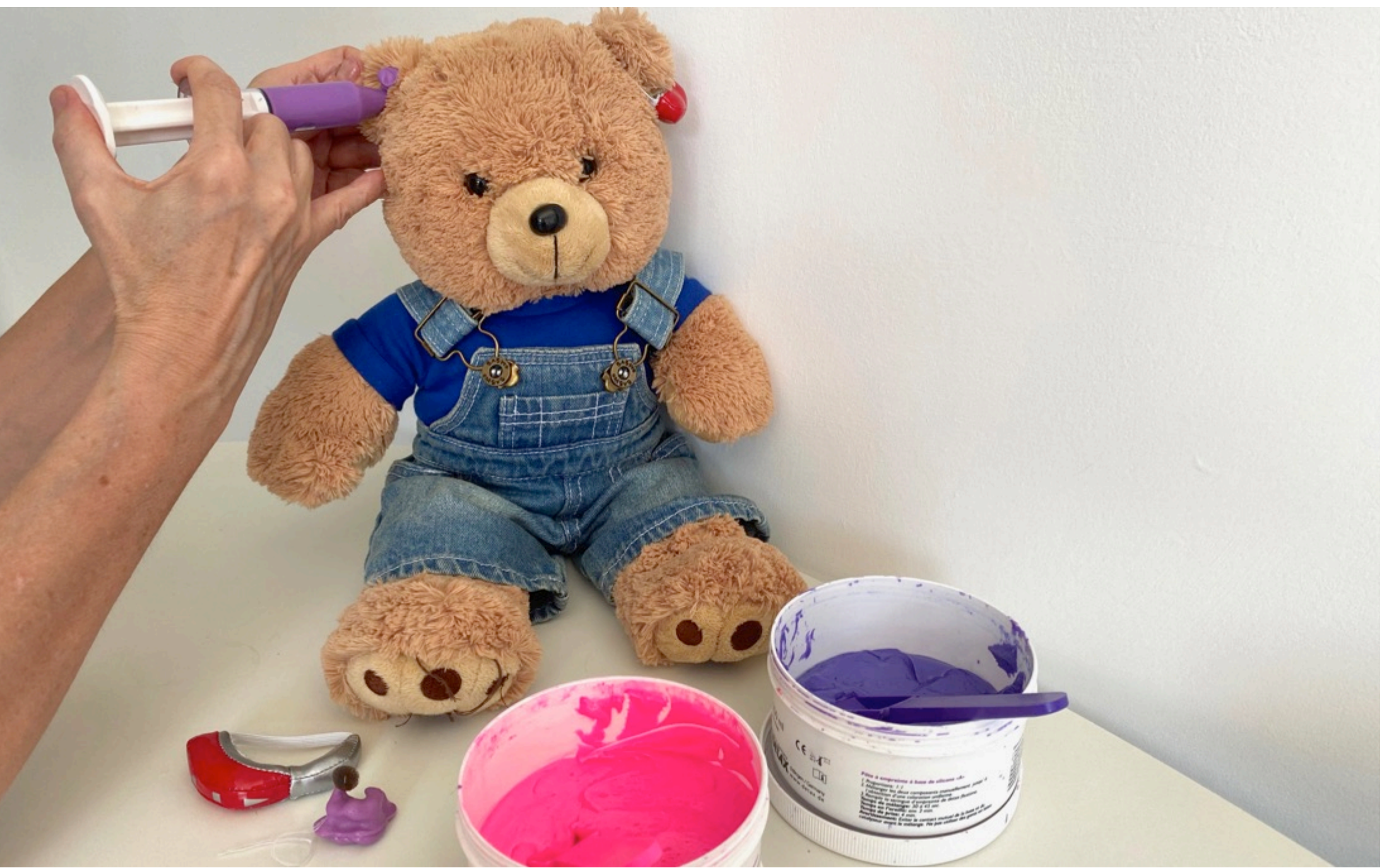
Ben needs new ear moulds. Well done Ben.